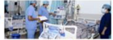
180 degree view Camera