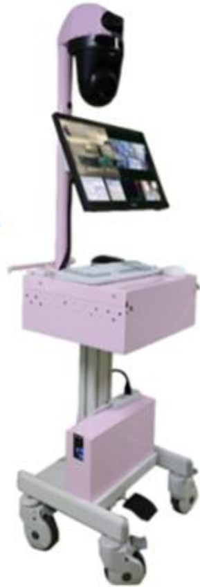
Kizuna Connect Trolley for KizunaWeb at Surgery Room (OR) or ICU