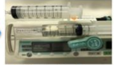
PTZ Remote Motion Camera

Watch Specific target by High Res Camera by moving & focus / defocus control from your PC